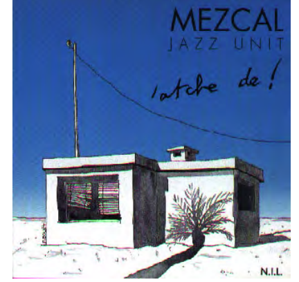
« 'ATCHE DE!» 1992