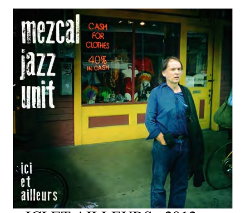
« ICI ET AILLEURS» 2012