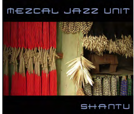
« SHANTU » 2009