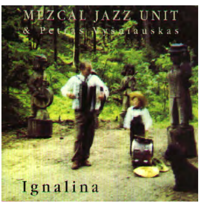
« IGNALINA » 1996