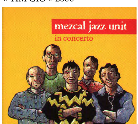
« IN CONCERTO » 1998